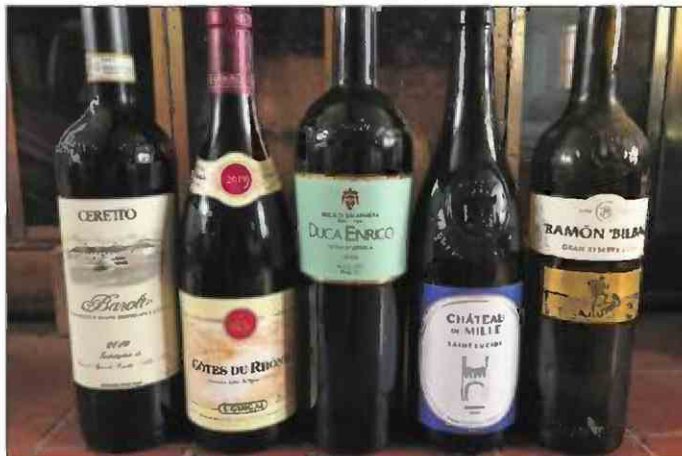
Here are last-minute wine suggestions for the holidays.

Flavors and aromas include lavender, cherry, blackberry and dark chocolate. A truly magnificent wine worthy of any special occasion.